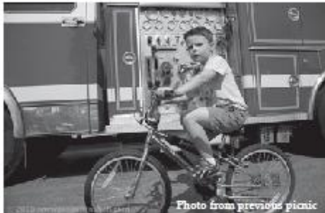
Photo from previous picnic

See you at our Centennial Celebration Picnic!