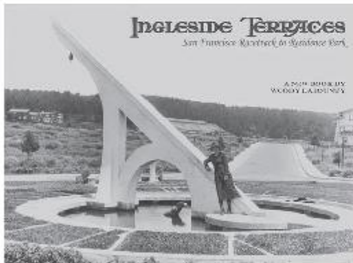
Celebrating a unique San Francisco neighborhood's first 100 Years