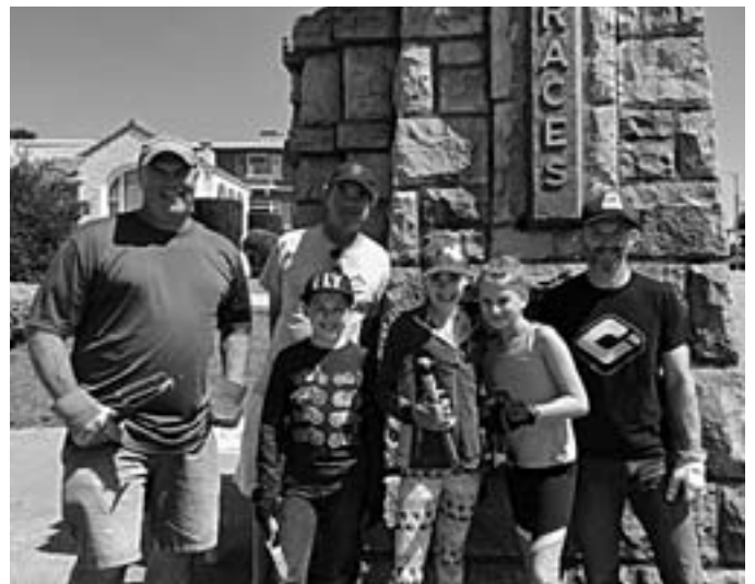
Landscaping Day participants, April 8.