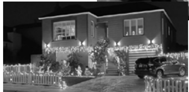
Winner of the Holiday Decorating Contest: 1325 Holloway.