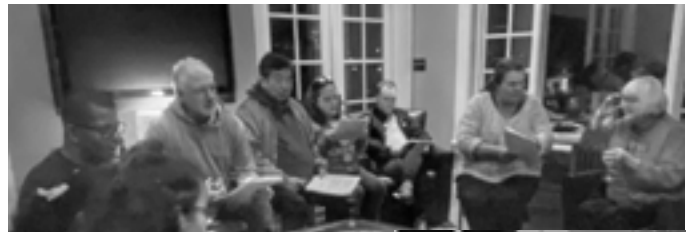
The holiday caroling party was lots of fun.

People over age 65+ with income under $93k can apply for free MUNI pass. SFMTA.com/fdreemuni4seniors .