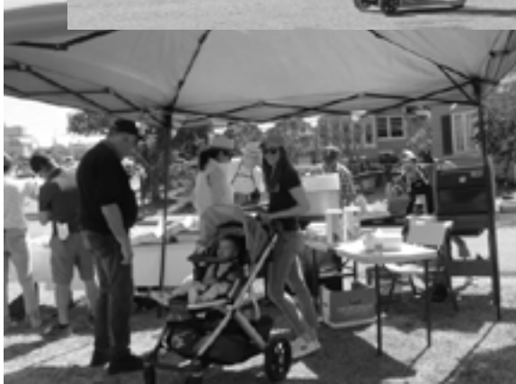
Photos from the ITHA Oktoberfest Picnic at the Sundial.